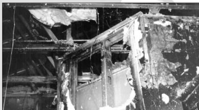
Charred steel studs from 1996 Brentwood, CA home fire maintained structural integrity.

For comparison purposes, most specifications call for greater than 33ksi yield strength for structural studs. "The fire," Simko continued, "seems to have had little effect on the mechanical properties of these members." Further testing produced evidence which indicated the "retention of mechanical strength in spite of the fire and furthermore suggests that the zinc coating remained on the surface," said Simko. "In some places, the zinc coating alloyed with the substrate to create a lightly iron-rich 'galvannealed' coating."