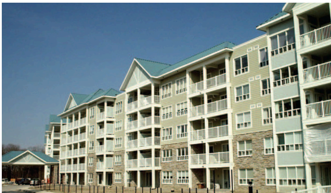
Bogart Pond Condominium Phase 1 nearing completion.

Just as beauty is in the eye of the beholder, so potential is in the eye of the imaginative. There are still folk out there who hear words like “pre-engineered” and “system” and think that translates to “box” - with self-imposed limits on both usefulness and appearance.